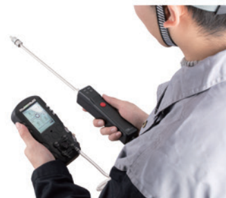
external pump gas detector

ООО «ТИ-СИСТЕМС» ИНЖИНИРИНГ И ПОСТАВКА ТЕХНОЛОГИЧЕСКОГО ОБОРУДОВАНИЯ