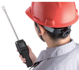
build-in pump gas detector